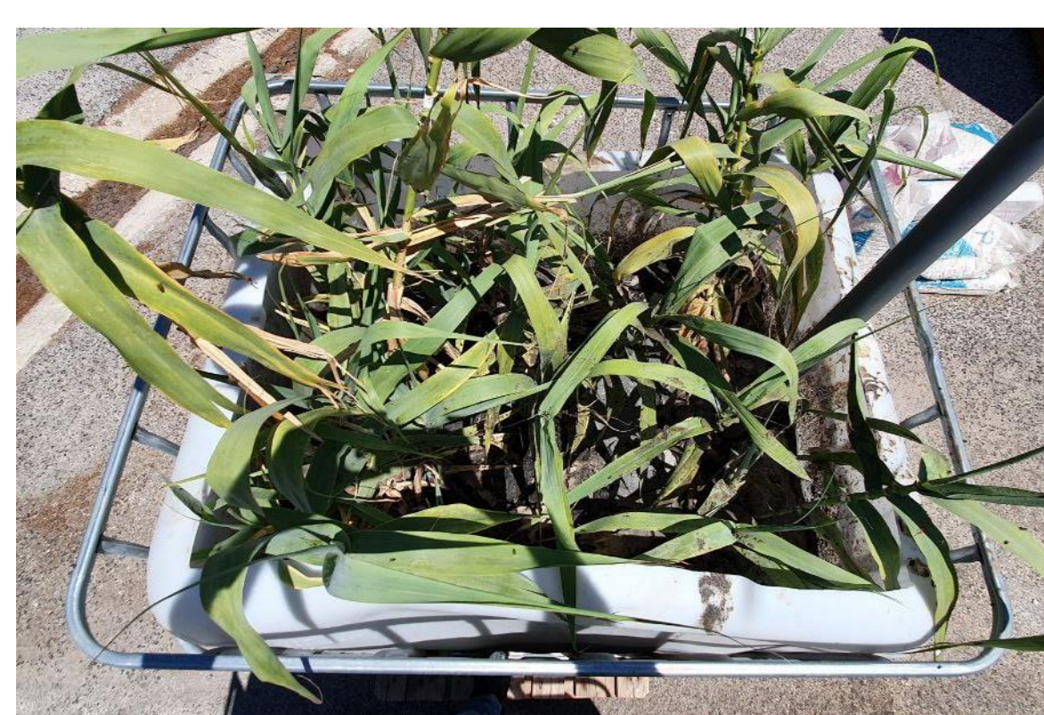
Arundo donax (5 tufts/m 2 )