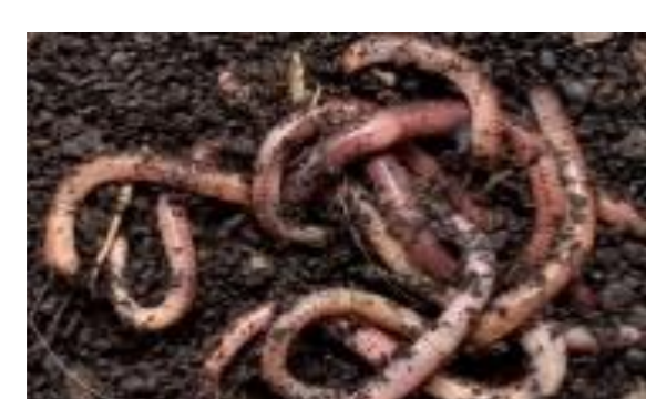
Earthworm (250 bodies of Eisenia fetida )